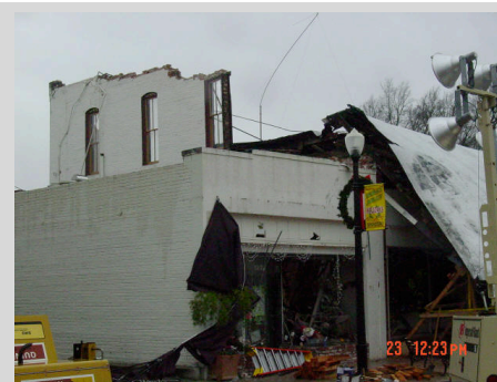
The heavily damaged Acorn/Mastagni Bldg, Paso Robles, CA, after the 12/22/2003 San Simeon earthquake. (Photo by Janise Rodgers, USGS).

In 2000, FEMA estimated that the annual losses due to earthquakes for the U.S. alone was $4.4 billion. Strong-motion time histories acquired by seismic networks are critical to earth scientists for understanding the physics of the earthquake process and to improve our ability to predict ground shaking from future earthquakes. The data of observed ground motions are important to engineers for designing safer structures, ultimately reducing the cost of earthquakes and loss of life.